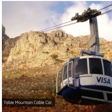
Table Mountain Cable Car