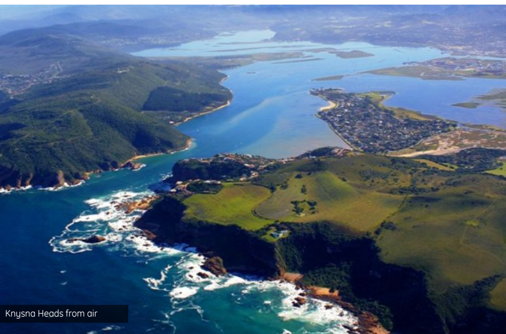
Knysna Heads from air