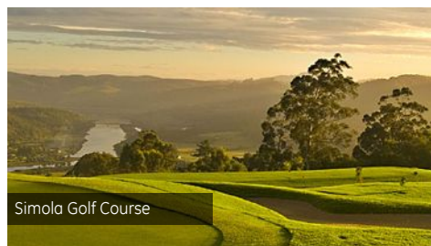
Simola Golf Course