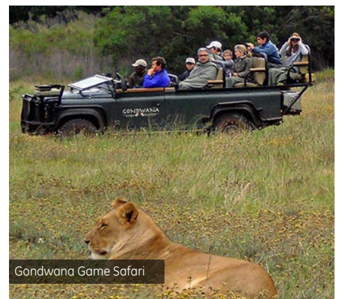
Gondwana Game Safari