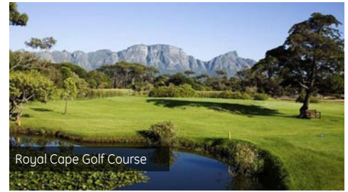
Royal Cape Golf Course