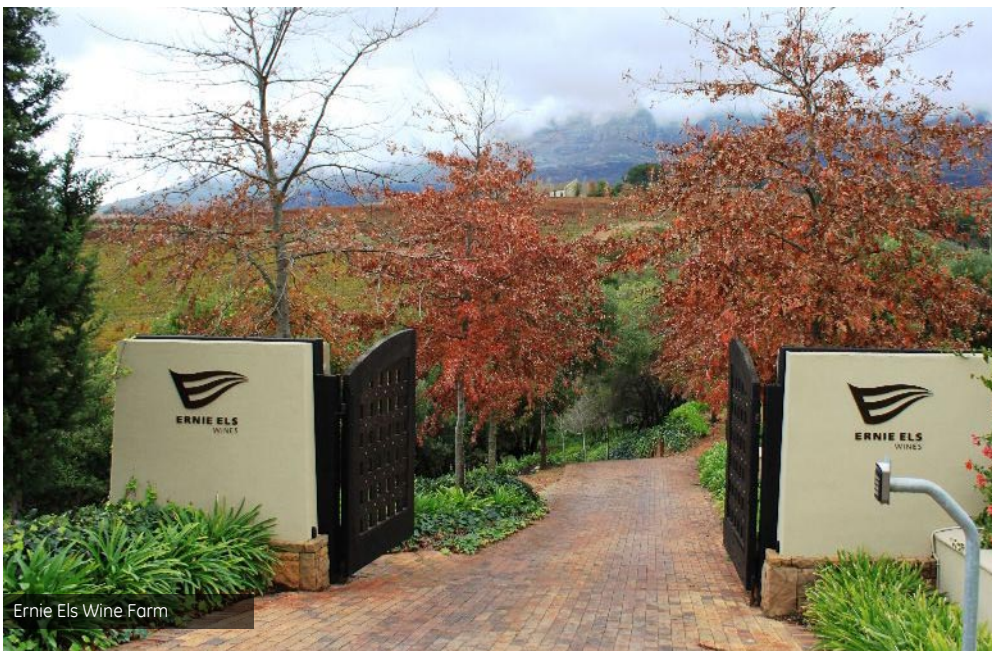
Ernie Els Wine Farm