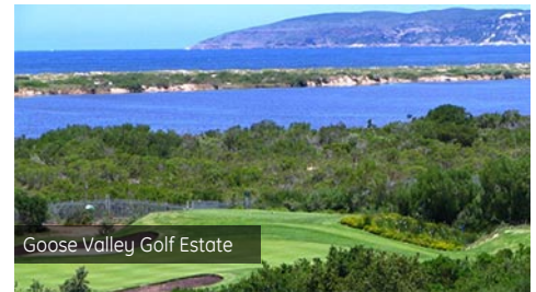
Goose Valley Golf Estate