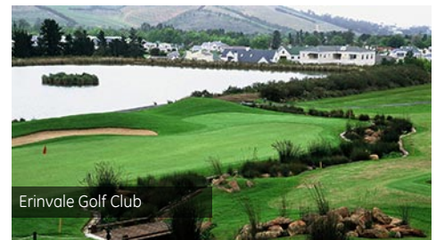
Erinvale Golf Club